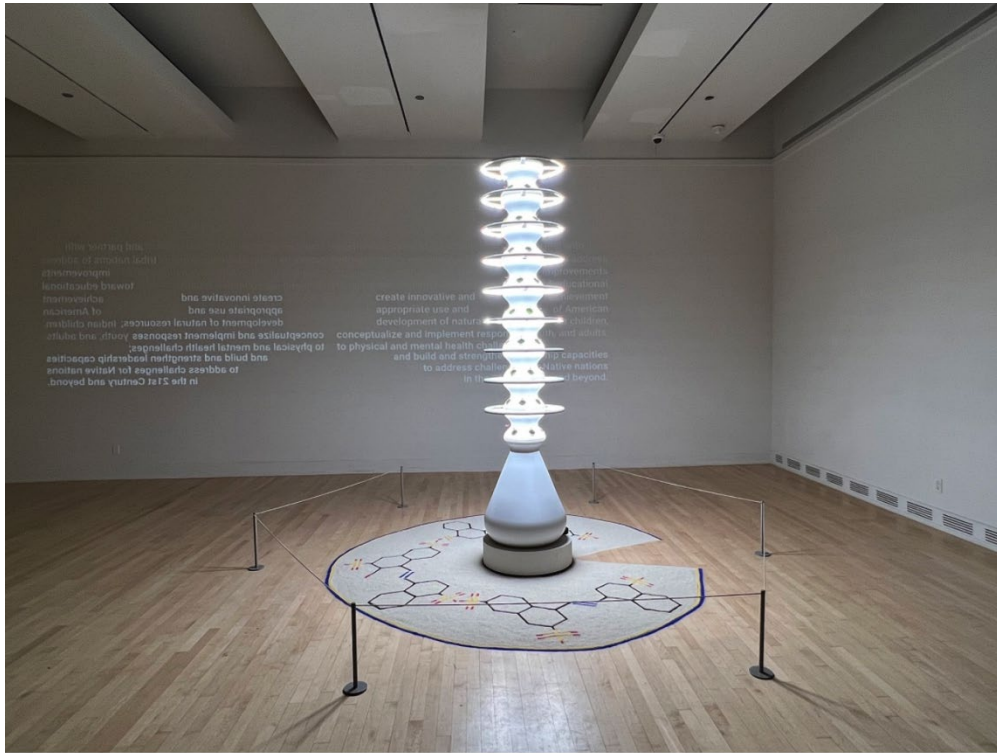
Steven Yazzie, "Yuméweuš" (2022), hydroponics tower, plants, sand, video