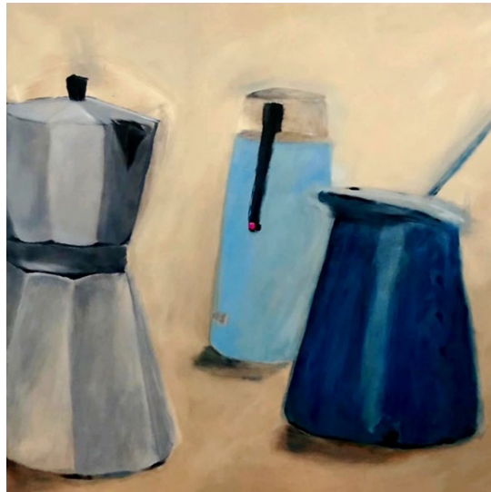
Ka Fee, Oil on Canvas (2022)